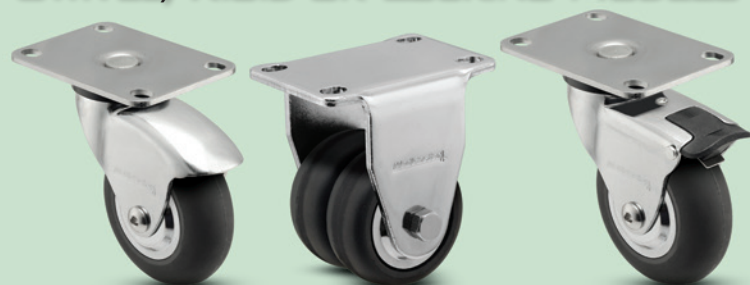
Free Swivel (CN, DN)